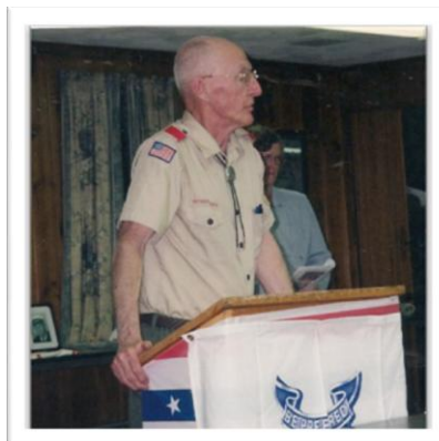
Ayer Troop #3 Boy Scouts Of America 40+ years and still active!