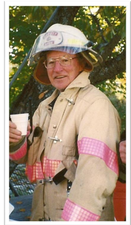
Ayer Fire Department 39 years