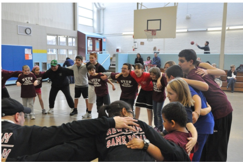
Unlimited Basketball players, coaches and buddies enjoying some circle time together.