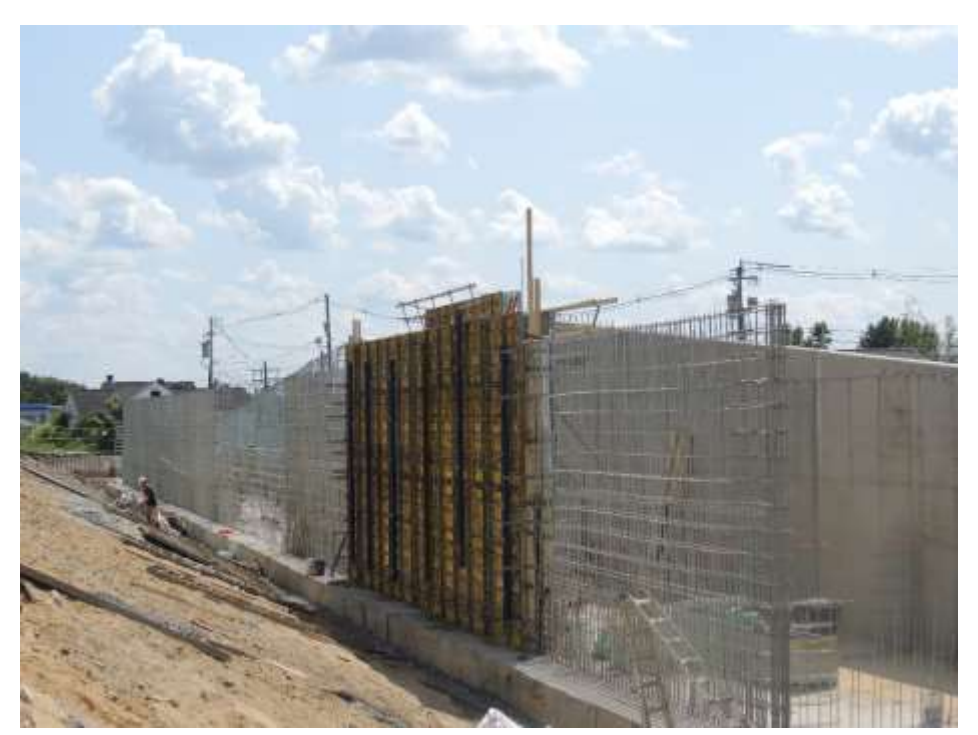
Re-Bar Retaining Wall Foundations