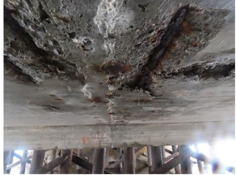
Photo 6: Spall to the center longitudinal joint in span #1 looking East.