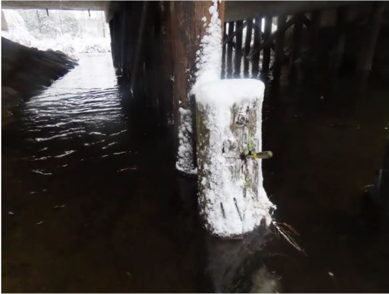
Photo 24: Rot to the battered brace pile at the North end of bent #2.