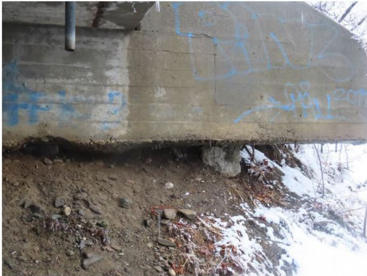
Photo 22: Severe undermining of the East breastwall/wingwall exposing the pile.