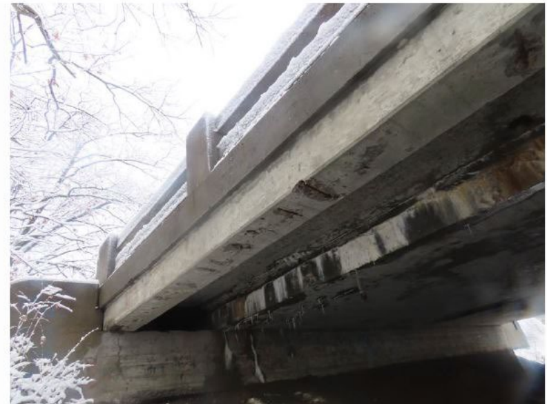
Photo 19: Spalls to the underside of the North sidewalk beam in span #3.