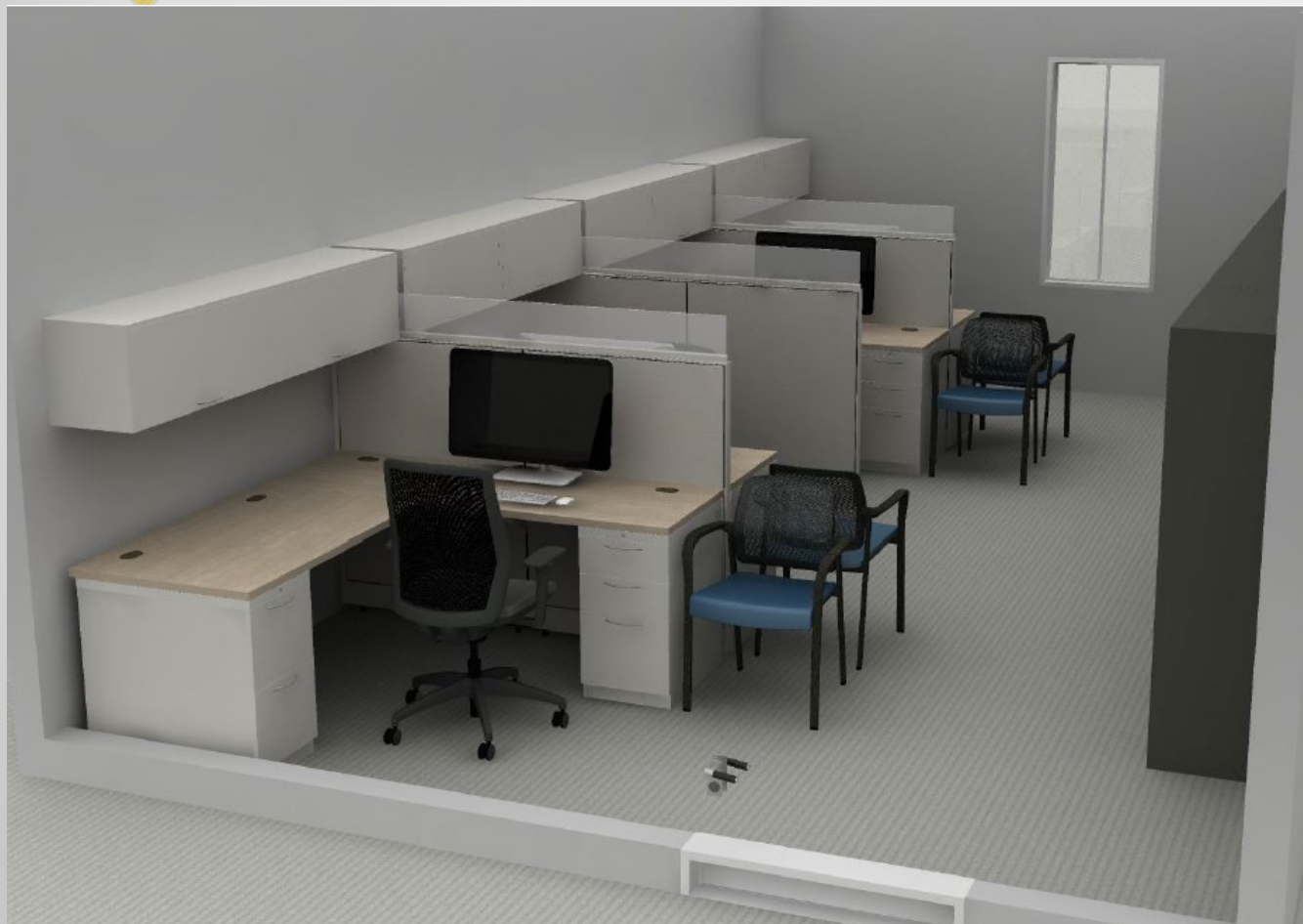
Proposed Supervisor Offices