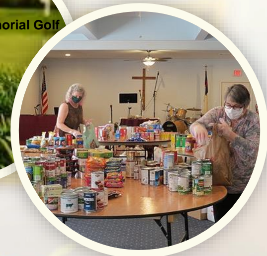
Local Food Pantry