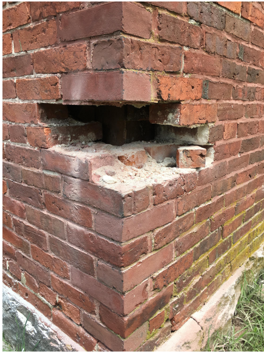
BEFORE: SAMPLE OF DAMAGES