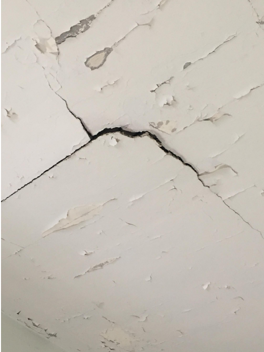
BEFORE: SLOWLY FALLING