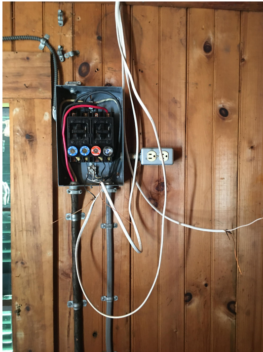
BEFORE: 60 AMP FUSE BOX