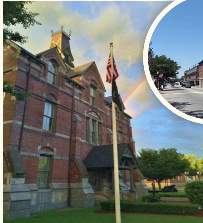
Ayer Town Hall