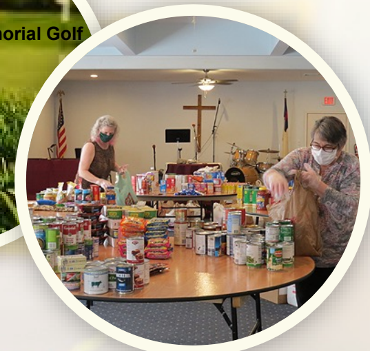
Local Food Pantry