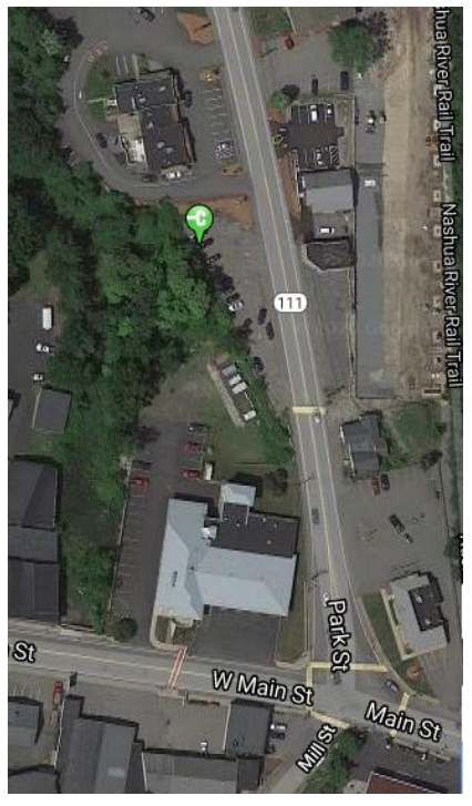
Image: EV Charging Station Location, courtesy of ChargePoint website.

The Town of Ayer was awarded $12,500 from the Massachusetts Department of Environmental Protection's Electric Vehicle (EV) Incentive Program (MassEVIP) to install a Level 2 EV charging station for the general public. Additionally, National Grid provided significant incentives and brought power to the site. The Town of Ayer is proud to offer the new public charging station open to EV drivers.